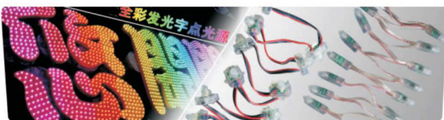
Spot light for advertsing