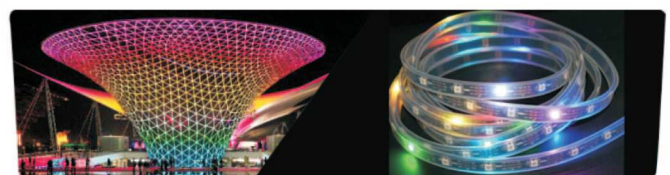
Flexible LED string